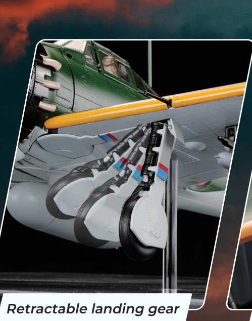
Retractable landing gear