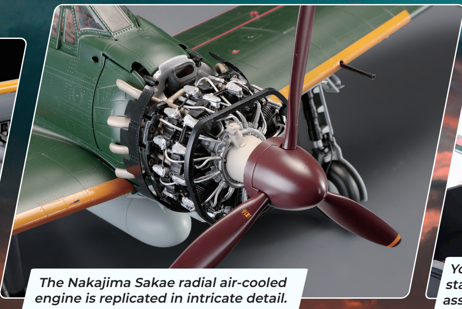
The Nakajima Sakae radial air-cooled engine is replicated in intricate detail.