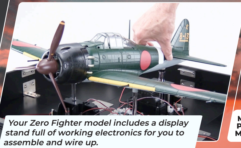
Your Zero Fighter model includes a display stand full of working electronics for you to assemble and wire up.